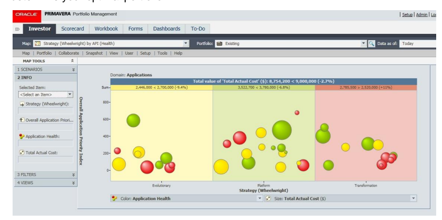
Figure 1. Graphical analysis provides a rapid evaluation and understanding of portfolio performance, speeds decision-making, and increases confidence in achieving strategic goals and value.

Primavera Portfolio Management features Investor Maps and dashboards to analyze key strategic decision-making data and metrics simultaneously. These essential metrics can also be used as the basis for "what if" scenarios planning in Investor Maps to determine your optimal portfolio mix.